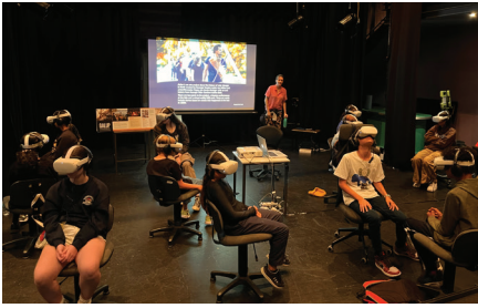
Year 9 Cultural Centre Excursion

MOUNT LAWLEY SENIOR HIGH SCHOOL An Independent Public School