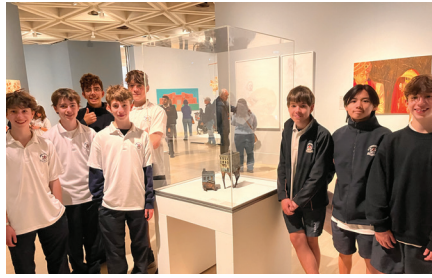
Galup VR Incursion