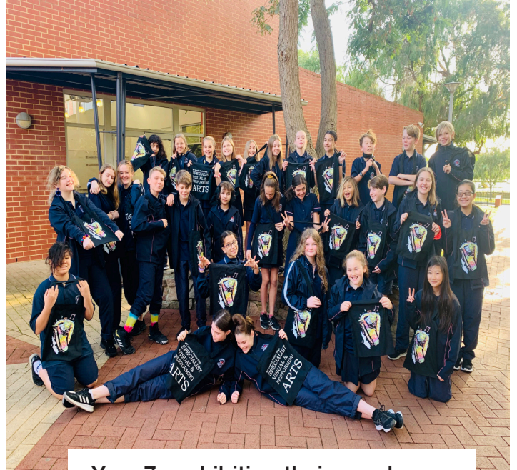
Year 7s exhibiting their new bags