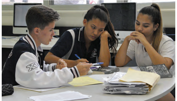
Peer Tutoring - ENGLISH & LITERATURE Just to give you a taste of what was happening last week in the library! Come and join us...Great opportunity to get ahead!