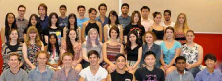
The Mount Lawley 90s Club

who will now move out into the wider community as worthy ambassadors for our school and alumni who have continued the proud tradition of excellence at Mount Lawley SHS. I very much enjoyed meeting with them and some very proud parents after the assembly to share in the celebration of their achievements.