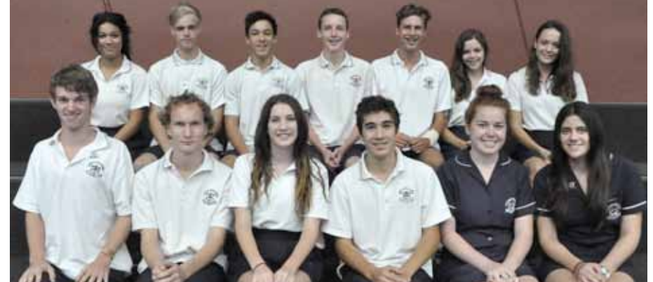
School House Swimming Captains

This information will be forwarded to the P&C so that