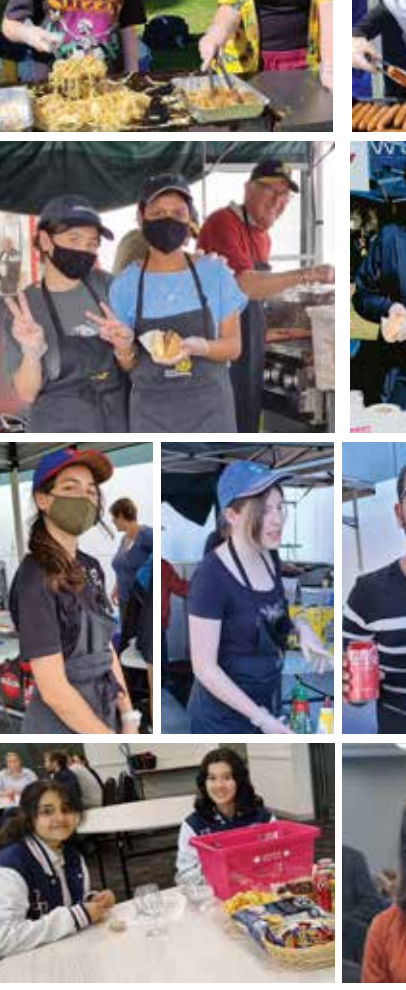
Photos Below: Students assisting at Fund Raising Functions conducted by the Rotary Clubs of Mount Lawley and Morley