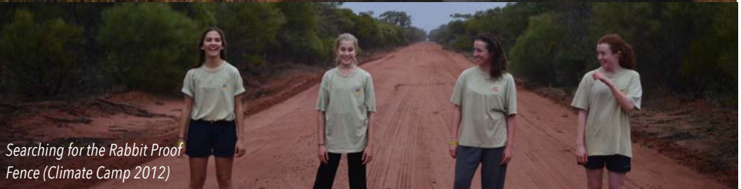
Searching for the Rabbit Proof Fence (Climate Camp 2012)