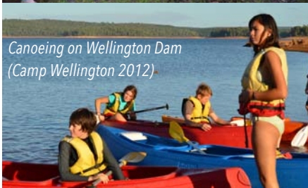
Canoeing on Wellington Dam (Camp Wellington 2012)