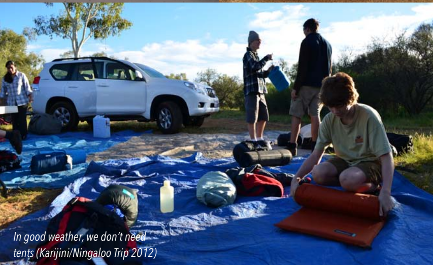
In good weather, we don't need tents (Karijini/Ningaloo Trip 2012)