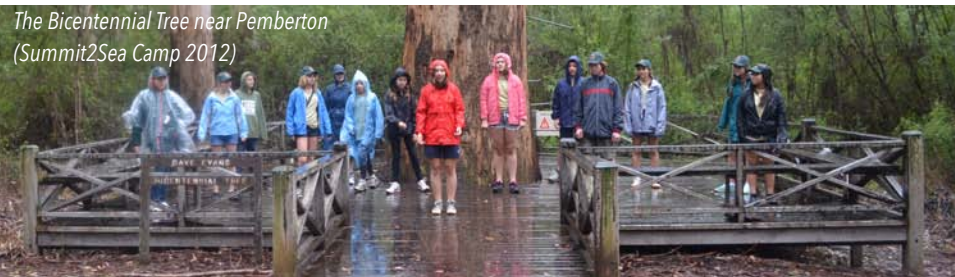
The Bicentennial Tree near Pemberton (Summit2Sea Camp 2012)

The Bush Ranger Cadet program is funded through the Department of Communities Cadets WA program, and hosted and supported by the Department of Environment & Conservation. At school level, our Unit has a Management Committee involving Instructors and Cadets.