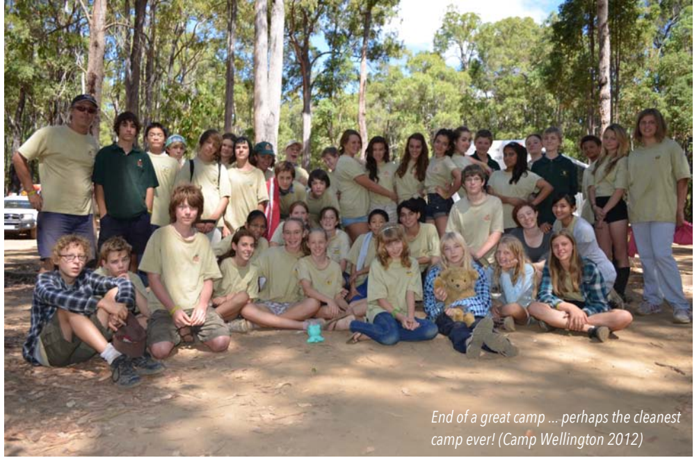
End of a great camp ... perhaps the cleanest camp ever! (Camp Wellington 2012)