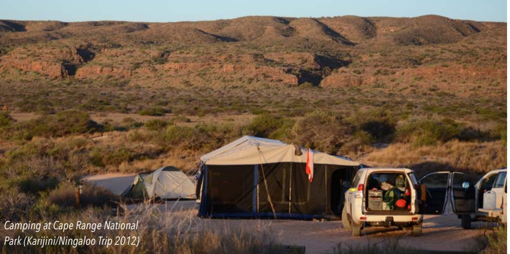
Camping at Cape Range National Park (Karijini/Ningaloo Trip 2012)