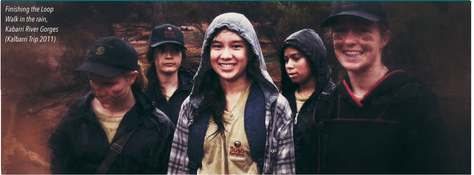
Finishing the Loop Walk in the rain, Kabbarri River Gorges (Kalbarri Trip 2011)