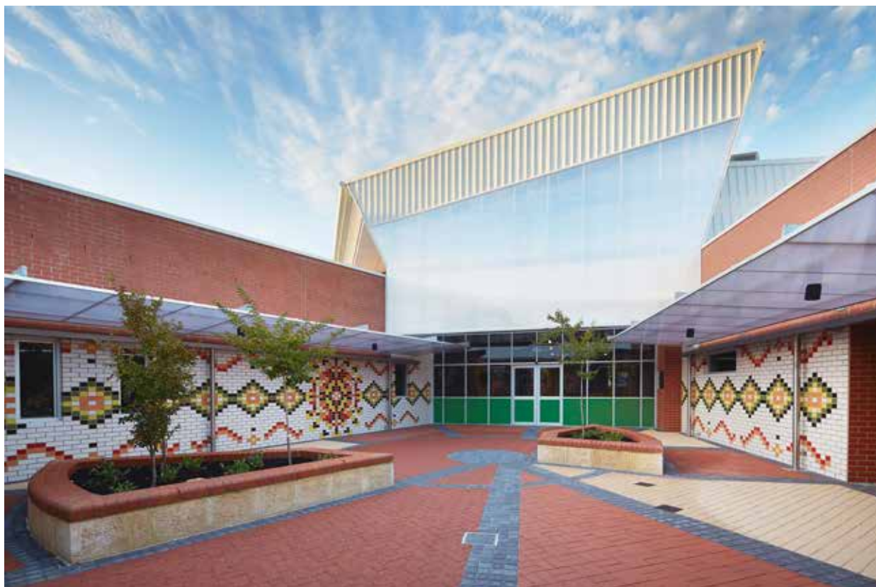
Upper School Building