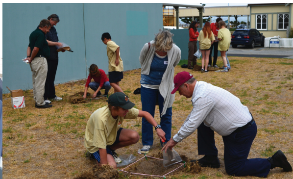
Mt Lawley Bush cadets taking soil samples for the MicroBlitz project