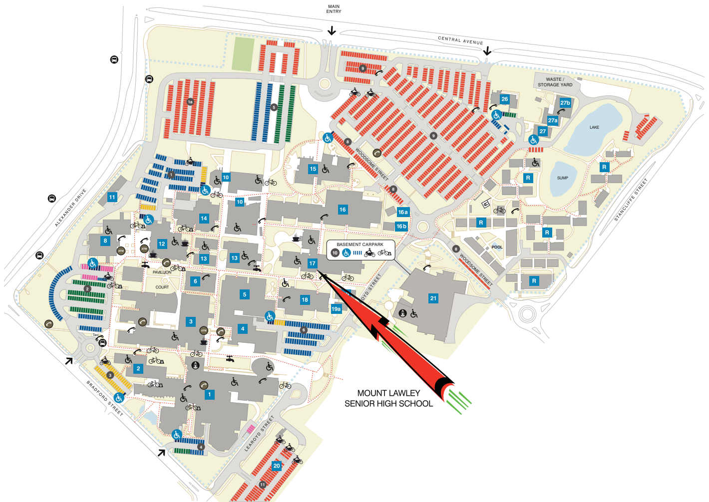
EDITH COWAN UNIVERSITY - MT LAWLEY CAMPUS