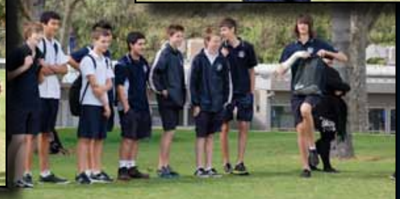
Indonesian - Tarian