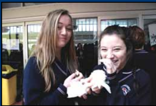
Chinese - Baozi