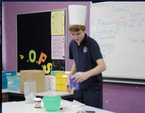
Italian - making Baci