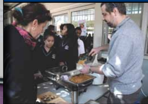
Indonesia - Curry